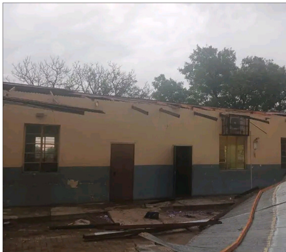
Mobile classrooms delivery delays hinders teaching and learning at Hosea Aphane Primary School after the school's roof was blown away by heavy winds in November last year.