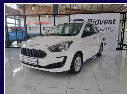
2020 Ford figo 1.5 ambiente (white) 108 000km