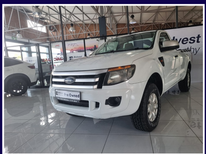
2015 Ford ranger 2.2 tdc1 xls 4x4 s/c (white) 140 000km