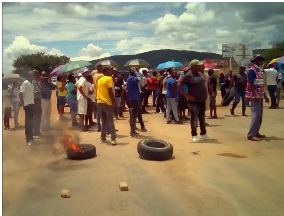
A protest by members of the community of Dennilton last Monday which led to the closure of the Eskom office in Elandsdoorn Village