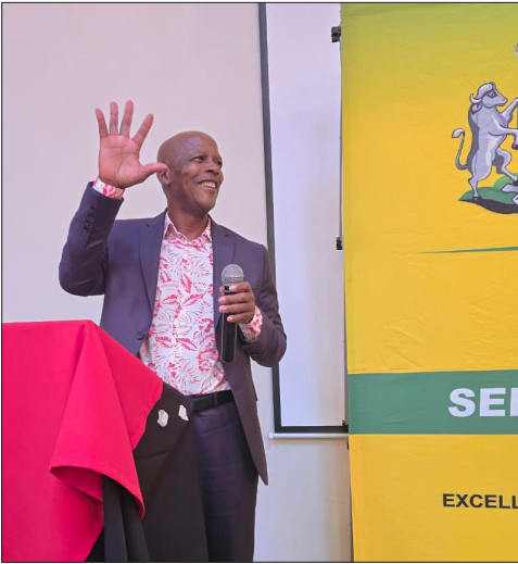
Government dignitaries from various sector departments honoured the invitation and attended the Sekhukhune South NSC Awards Ceremony, held at The Park Hotel in Mokopane.