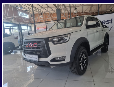
2024 JAC T8 2.0 lux d/c (white) 50 000km