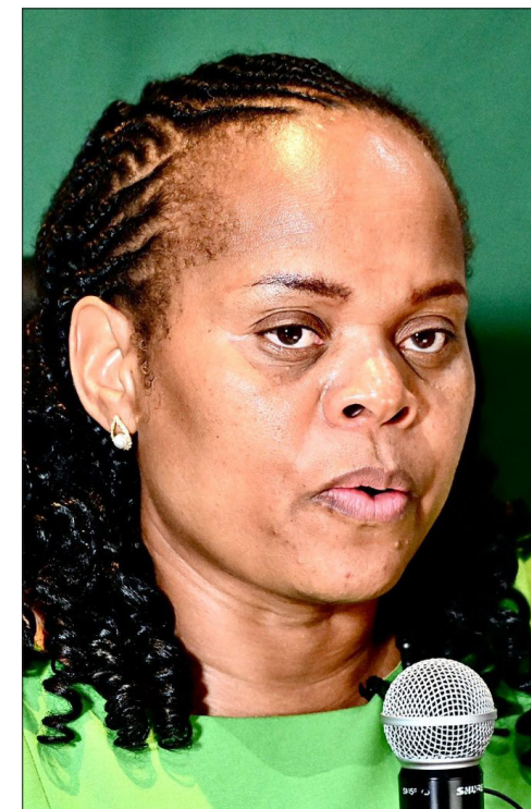
Limpopo Premier Dr. Phophi Ramathuba.

LIMPOPO - Limpopo Premier Dr. Phophi Ramathuba applauded President Cyril Ramaphosa's decisive focus on water security.