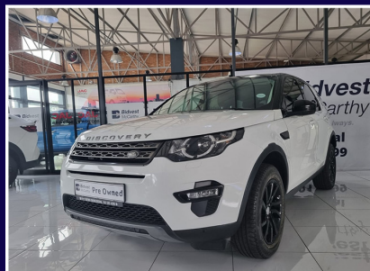
2019 Land rover discovery sport 2.0 i4 D SE (white) 80 000km