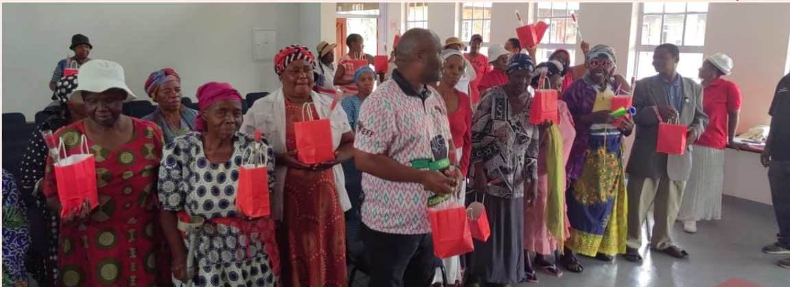
Elderly citizens at the Pholoso Drop-In-Centre celebrating Valentine’s Day at the centre premises in Elandsdoorn Township.