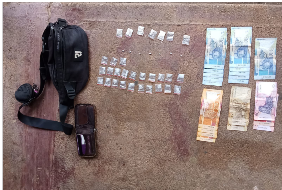
Transparent plastic bags containing crystal meth, nyaope, rock drugs and cash money were recovered by the police during the ongoing Operation Vala Umgodi.

The ongoing integrated Operation Vala Umgodi continues to yield significant results across Limpopo, with the arrest of 33 suspects, aged between 18 and 49, for crimes ranging from illegal mining, possession and dealing in illicit drugs, to contravention of immigration laws.