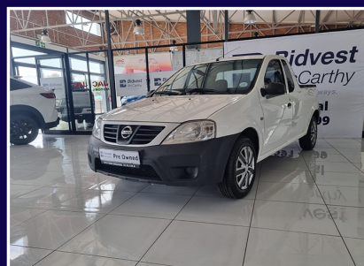
2015 Nissan np200 1.5 dci a/c safety pack (white) 104 000km