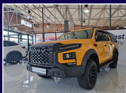
2025 JAC T9 2.0CTi Double Cab 4wd Super Lux