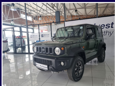
2020 Suzuki jimny 1.5 glx a/t 3dr (green) 89 000km