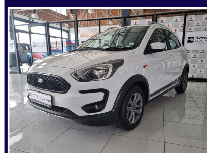
2020 Ford figo freestyle 1.5 titanium (white) 90 000km