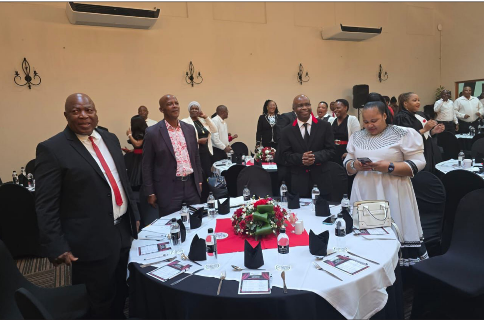
Government dignitaries from various sector departments honoured the invitation and attended the Sekhukhune South NSC Awards Ceremony, held at The Park Hotel in Mokopane.